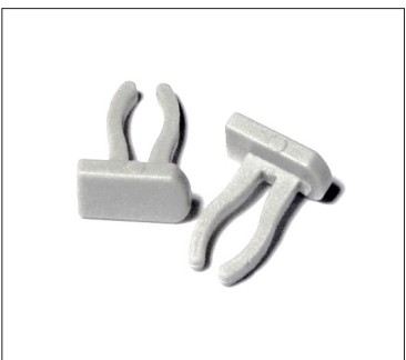
Profile S-7 end caps

Finally insert the S-7 end caps in the gaps between the side profiles and the shorter top sign row, on both sides.